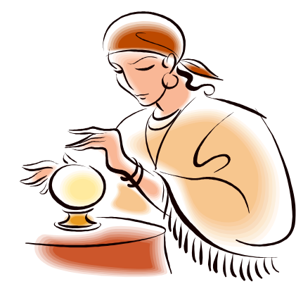
Request letters are accepted until May 10th

It is important that we have the most accurate enrolment numbers as possible.